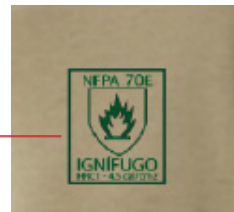
Logotipo Ignifugo HRC1 - 4,5cal/cm2 Estampado 5cmx4cm