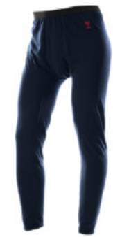
Color Azul Marino