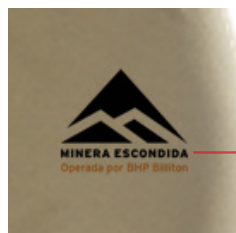
Logotipo Minerera Escondida Estampado 7cmx1,5cm