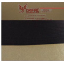
Etiqueta - Composición tela Estampado 5cmx4cm